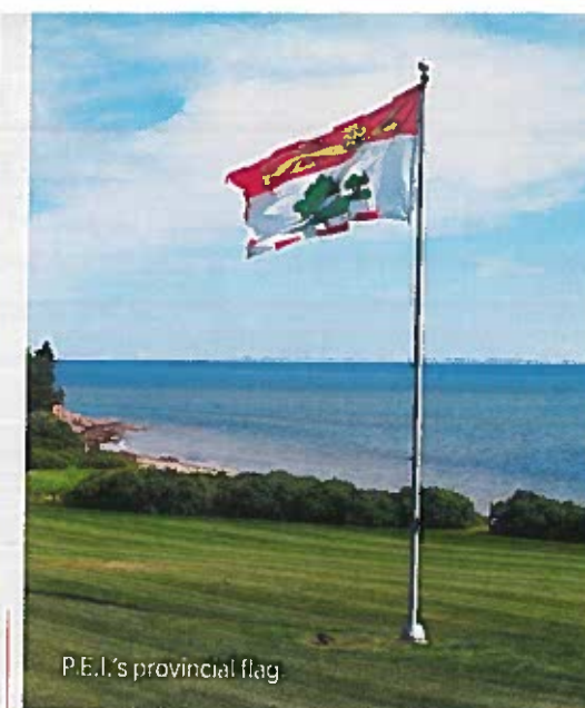
P.E.I.'s provincial flag